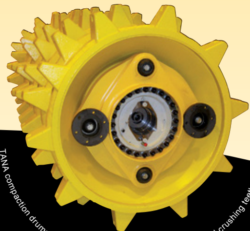
TANA compaction drums – two full width drums with forged solid steel crushing teeth.

Weights and measurements are given within normal tolerances. Manufacturer reserves the right to alter the above as necessary. Some features shown may be optional and not standard.